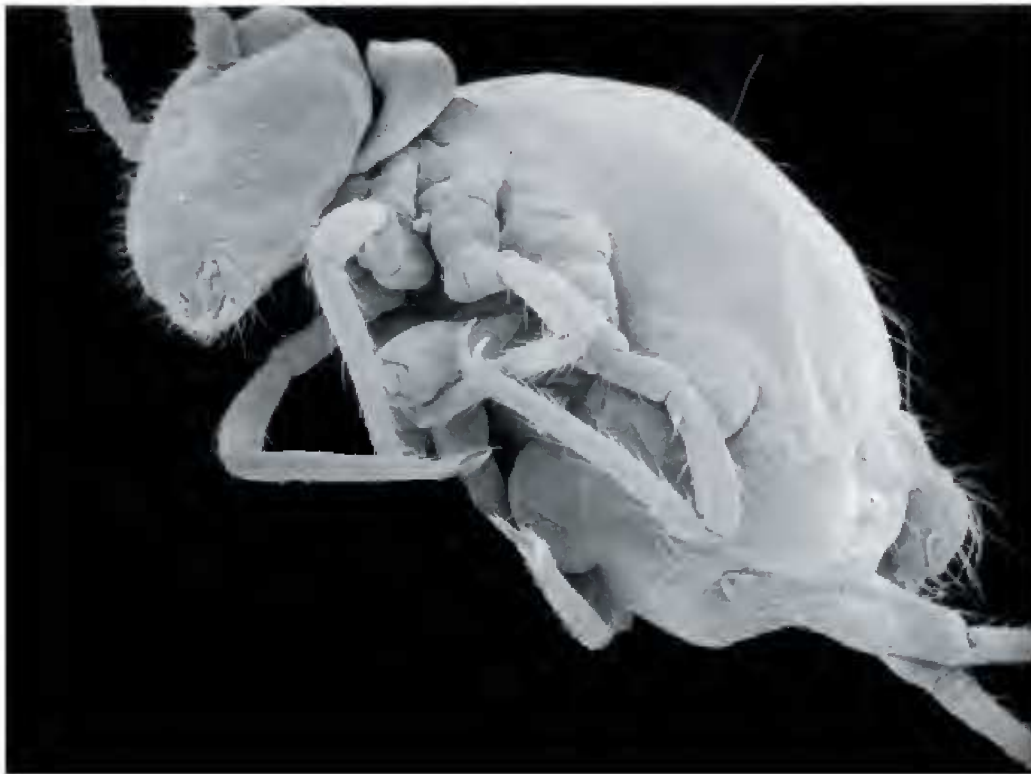
Figure 2 (left). Scanning electron micrograph of Adelphoderia sp., < 1 mm